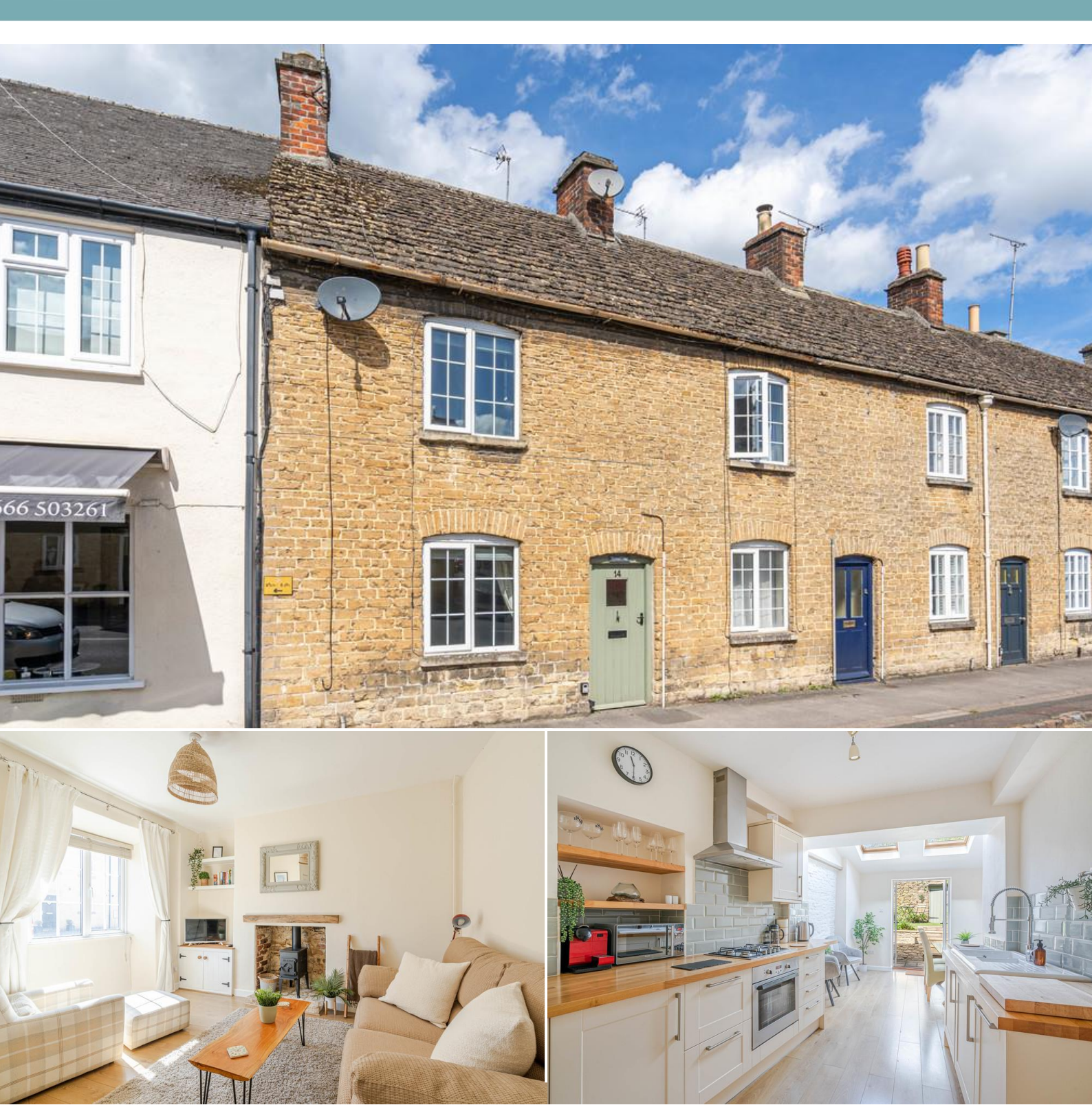
Foxwood Cottage, 14 London Road, Tetbury, GL8 8JL